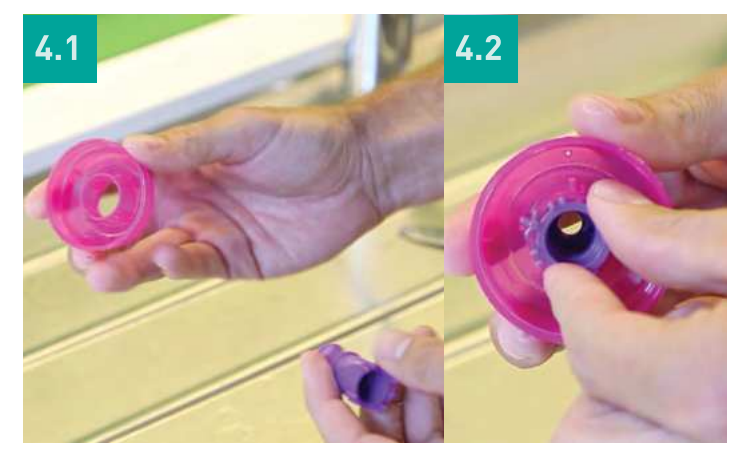
4. To reassemble, relocate nozzle into cover.