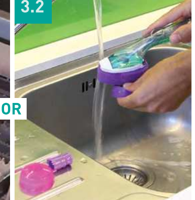
3.2 Hand wash all bottle and lid components with hot soapy water.