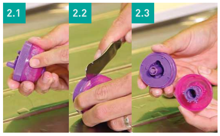
2. Carefully place blunt utensil in the opening created in previous step. Push utensil firmly down and twist. Repeat around the edge until cover can be removed. Pull sipper tip out of cover.